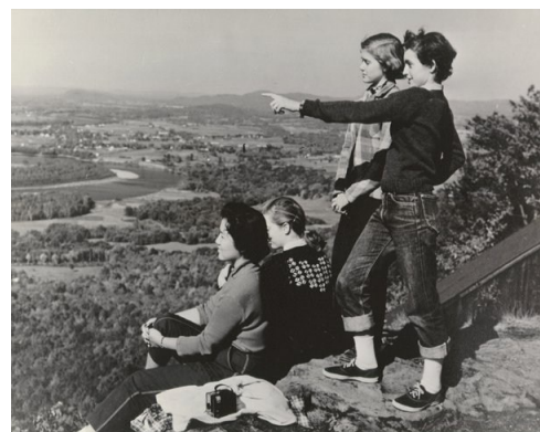
Smithies at the Summit House.

Do you have any pictures from one of your Mountain Day activities? If so please share it with us as we may use it in a future Mountain Day card that gets mailed to Grécourt Society members.